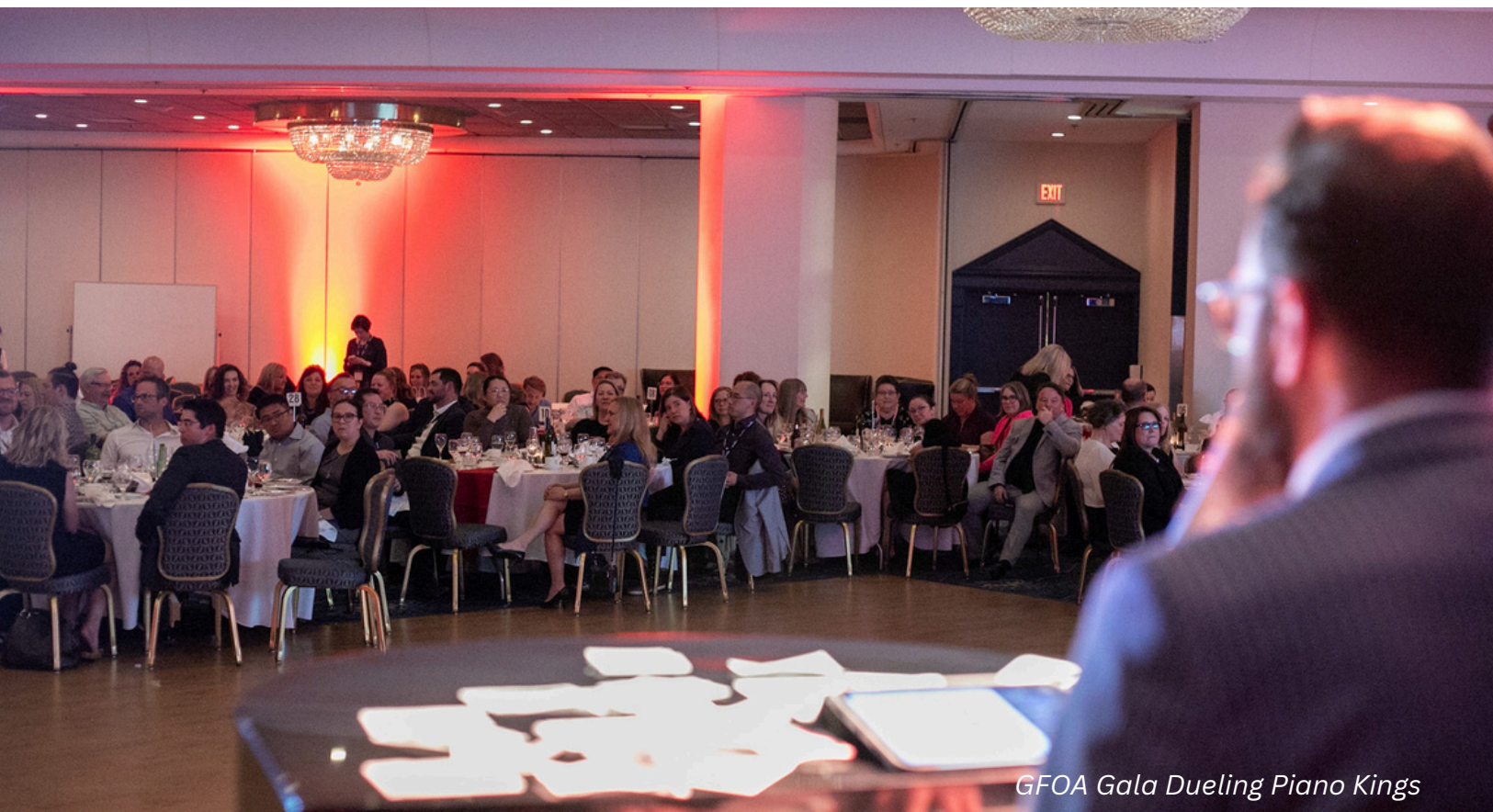
GFOA Gala Dueling Piano Kings

Your company introduced as the session sponsor, company logo displayed on the screen and the sponsor can briefly introduce company services and the session speaker.