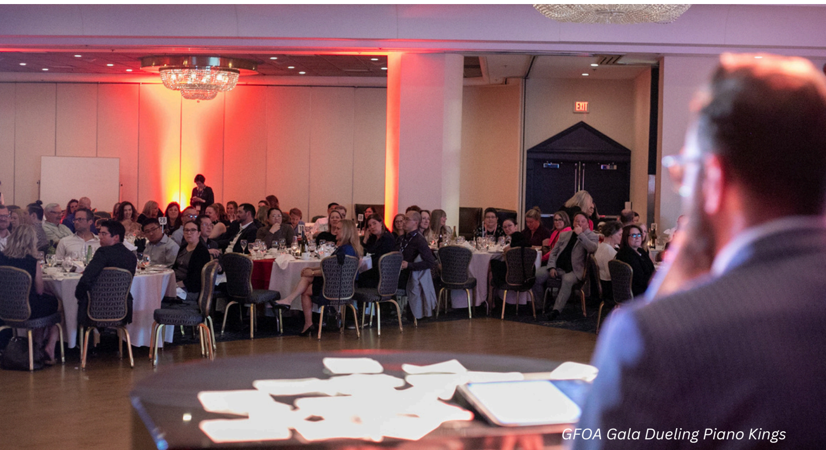
GFOA Gala Dueling Piano Kings

Your company introduced as the session sponsor, company logo displayed on the screen and the sponsor can briefly introduce company services and the session speaker.